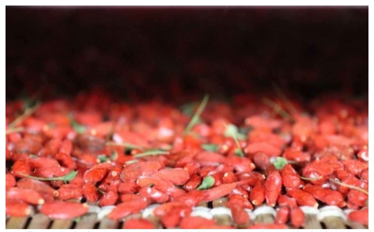
The wolfberry industry in Ningxia is entering a new stage.